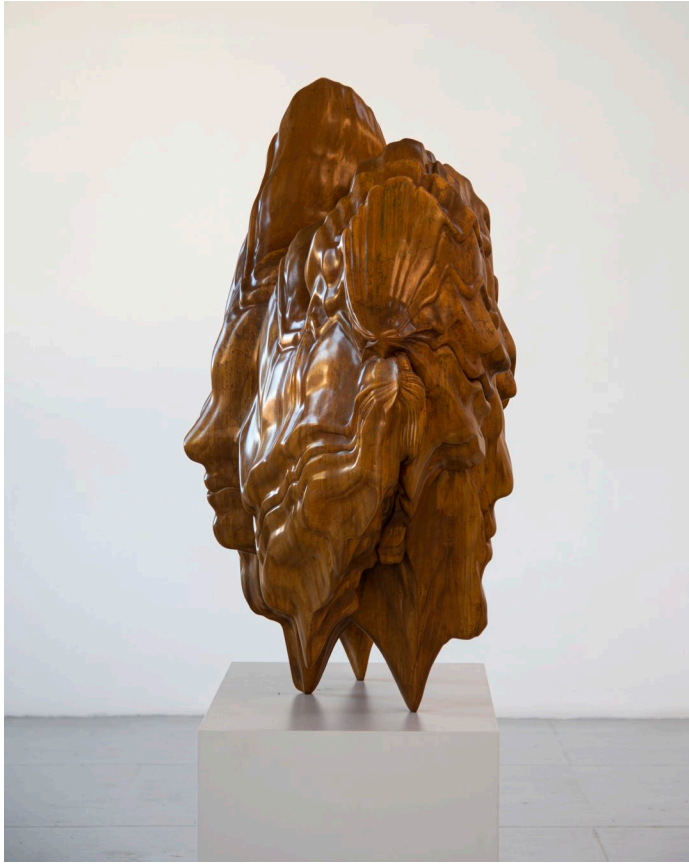
In Frequencies , 2018, Bronze, cm 125 x 67 x 125

Tony Cragg's art focuses on the multiple relationships existing between human beings and their environment. Protagonist of continuous research on content and form in the field of sculpture, using various techniques and materials such as marble, bronze, wood, and metal, the artist focuses on the connection between figure, object, and landscape.