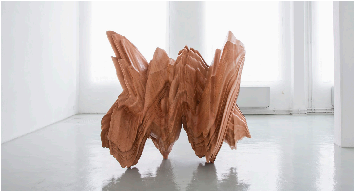
Karst , 2020, Wood, cm 190 x 220 x 160

Among the works on display are also some sculptures from the recently concluded exhibition held in the evocative setting of Houghton Hall, a historic house located in Norfolk, Great Britain.