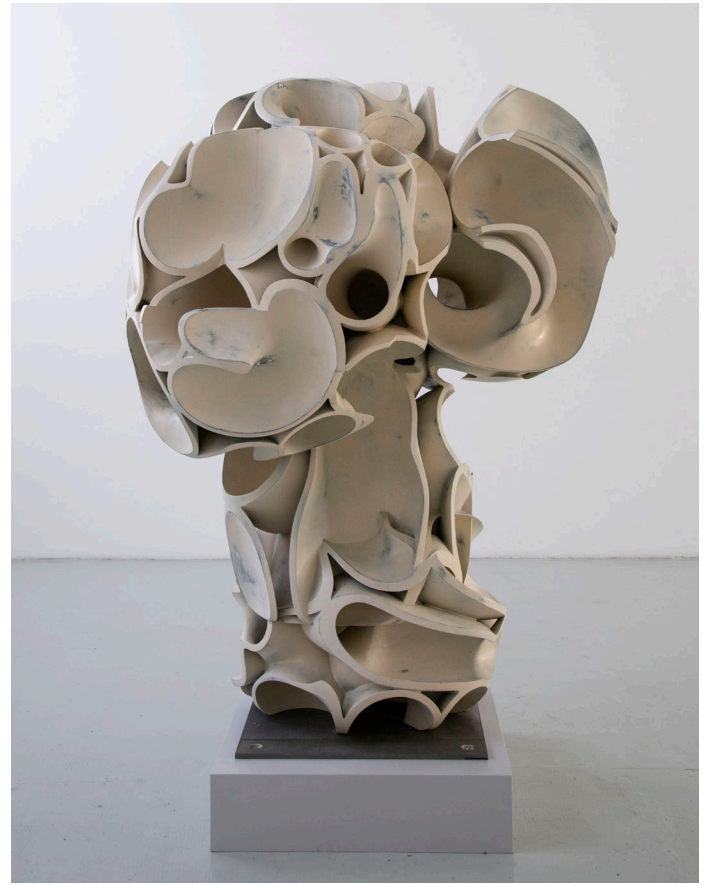
Skull , 2017, Aluminium, cm 190 x 137 x 105

Among the works on display are also some sculptures from the recently concluded exhibition held in the evocative setting of Houghton Hall, a historic house located in Norfolk, Great Britain.