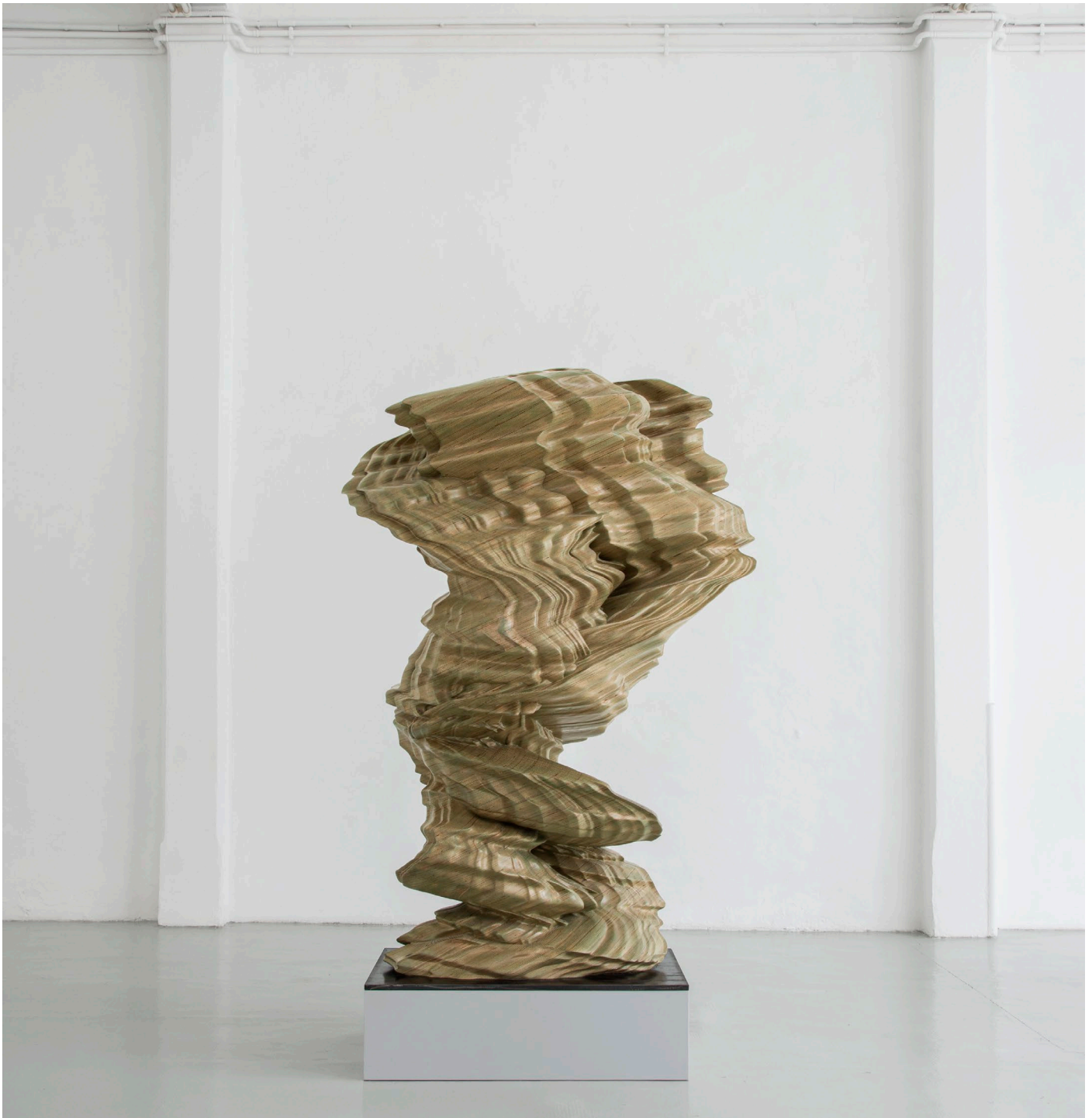
Stack , 2018, Wood, cm 220 x 148 x 135

Tony Cragg (Liverpool, UK, 1949) lives and works in Wuppertal, Germany, since 1977, where he started the Skulpturenpark Waldfrieden , the foundation that bears his name in 2008. He graduated from the Wimbledon School of Art, London, UK (1973) and received a Master of Arts from the Royal College of Art, London, UK (1977). Recent solo exhibitions include: Haus am Waldsee, Berlin, Germany, 2021; Houghton Hall, Norfolk, UK, 2021; Boboli Gardens, Florence, Italy, 2019; Yorkshire Sculpture Park, UK (2017); National Museum of Havana, Cuba (2017); MUDAM Luxembourg, Luxembourg (2017); Ludwig Museum, Koblenz, Germany (2017); Wrocław Contemporary Art Museum, Wrocław, Poland (2017); The State Hermitage Museum, St Petersburg, Russia (2016); Von der Heydt Museum, Wuppertal, Germany (2016); Benaki Museum, Athens, Greece (2015); Gothenburg International Sculpture Exhibition, Gothenburg, Sweden (2015). In 1988 he represented Britain at the 43rd Venice Biennale and in the same year was awarded the Turner Prize by the Tate Gallery, London, UK. Elected Royal Academician in 1994 by the Royal Academy of Arts, he received the Praemium Imperiale for Sculpture from the Japan Art Association in 2007. He was appointed CBE in 2002 and Knight's Bachelor in 2016.