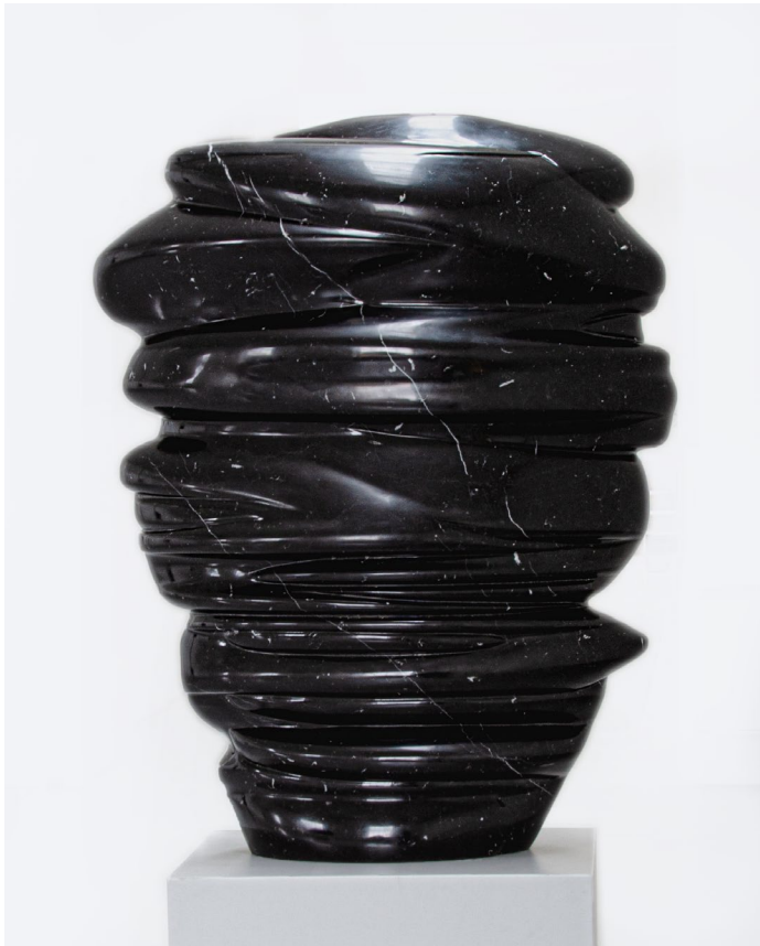
Masks , 2021, Black Marquina marble, cm 110 x 86 x 39